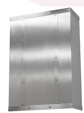
Brushed Stainless with Modern Accents